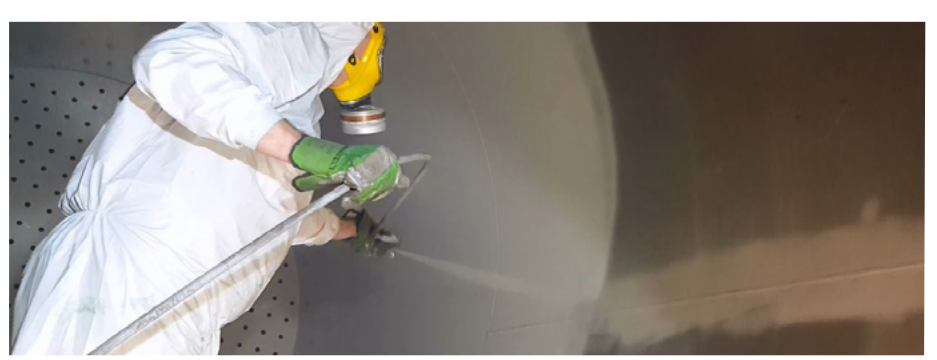
Simple application of PROGUARD CN 200 using airless sprayer. On this picture you can see that the welding seams were pre-treated with the coating within the preparatory works.